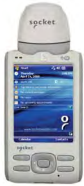
CF Scan Card 5XRx with Socket SoMo® 650Rx handheld computer (sold separately)