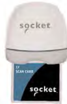
CF Scan Card 5XRx

Designed for healthcare professionals, the Socket CompactFlash Scan Card 5XRx incorporates antimicrobial materials that provide an extra layer of protection to the product to protect against the multiplication and spread of potentially harmful bacteria and microbes. Delivering superior barcode scanning performance in a CompactFlash (CF) form factor, the CF Scan Card 5XRx is an ideal data collection tool for the most demanding healthcare applications and environments.